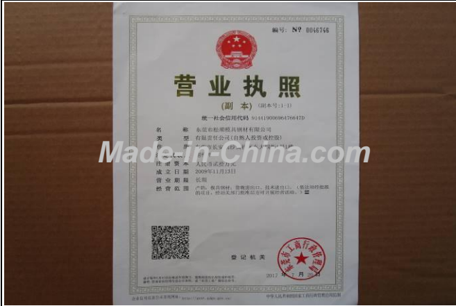
Description: Business License